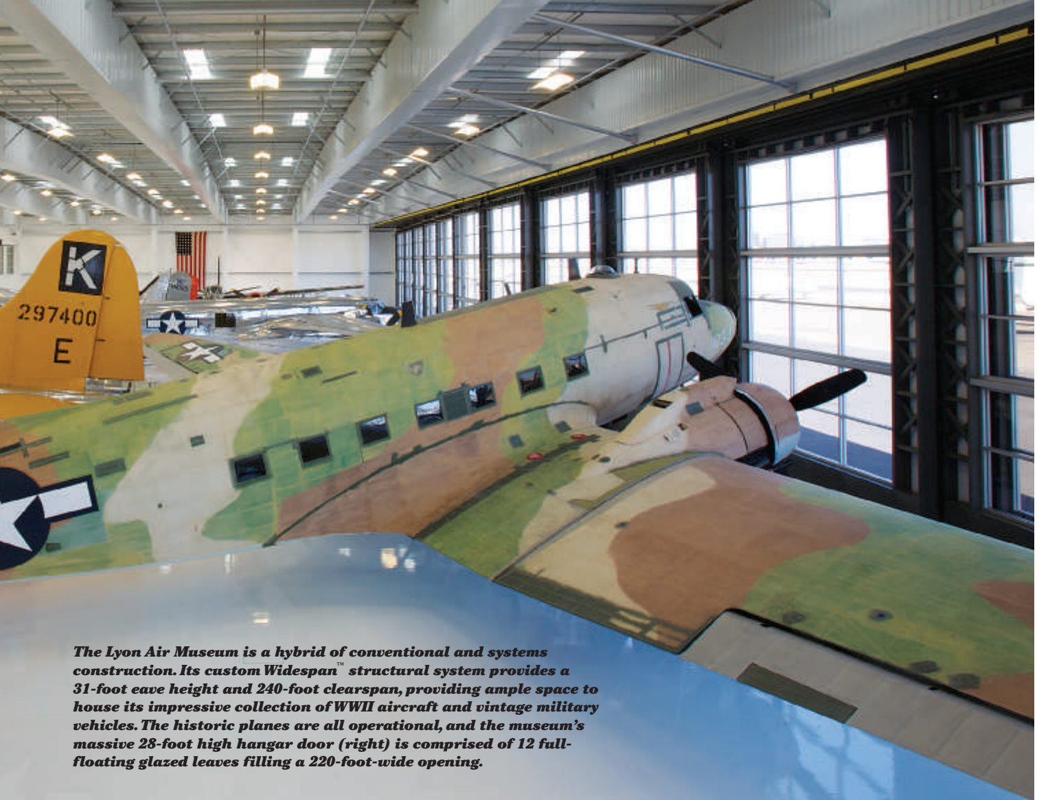
The Lyon Air Museum is a hybrid of conventional and systems construction. Its custom Widespan™ structural system provides a 31-foot eave height and 240-foot clearspan, providing ample space to house its impressive collection of WWII aircraft and vintage military vehicles. The historic planes are all operational, and the museum's massive 28-foot high hangar door (right) is comprised of 12 full-floating glazed leaves filling a 220-foot-wide opening.

expanse of full-height solar bronze insulated glazing, affording an excellent view of the museum's interior. Inside the windows, an elevated walkway—also conventionally framed—overlooks the historic aircraft below.