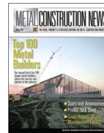
On the Cover: This KAAPA Grain Storage facility in Elm Creek, Neb. was constructed by Pioneer Construction Inc. (ranked no. 34 in our Top 100 Metal Builders), using a metal building from Varco Pruden Buildings.